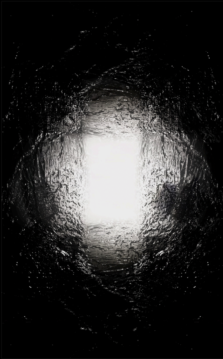
In / Around , 2020, Inkjet Print.