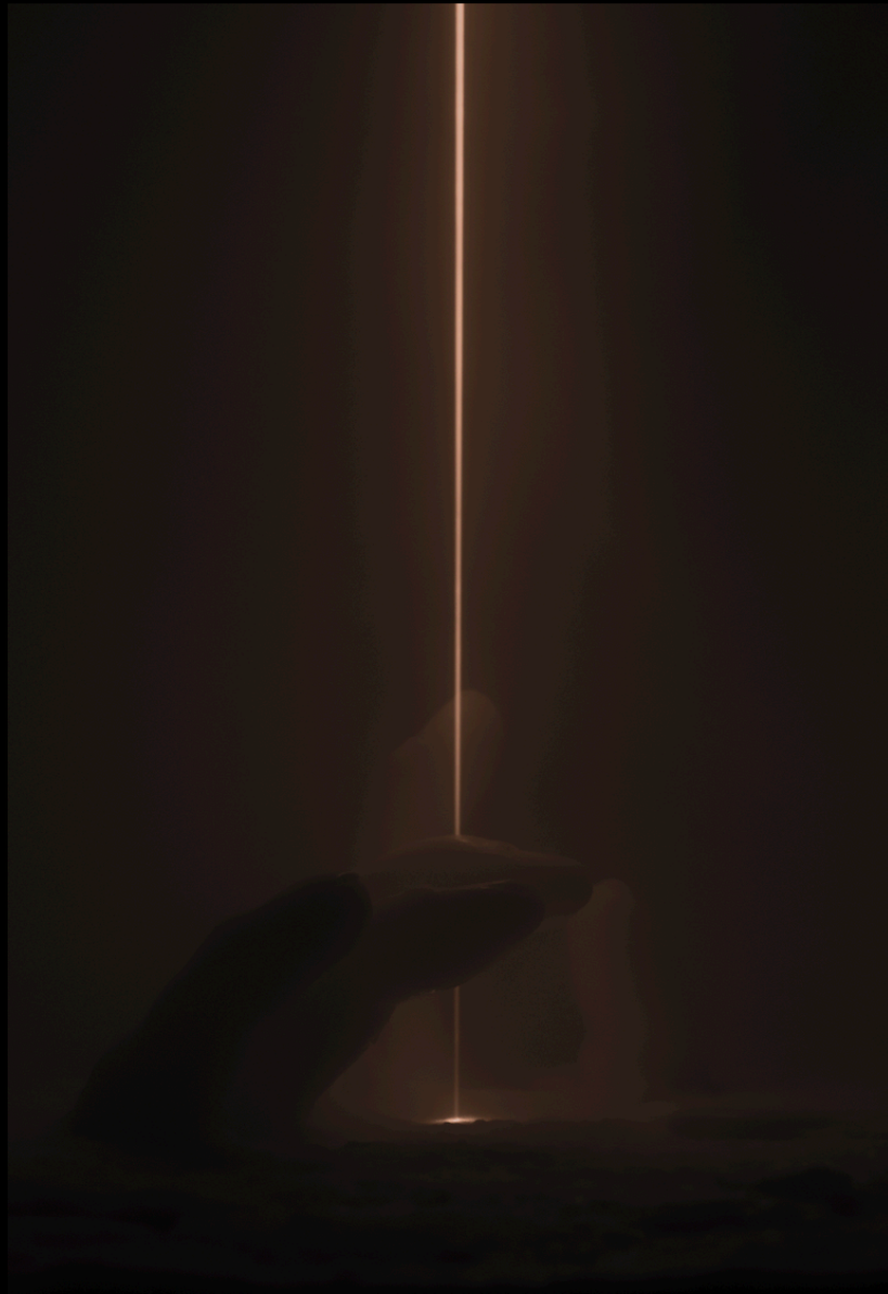
Untitled, 2020, Inkjet Print.