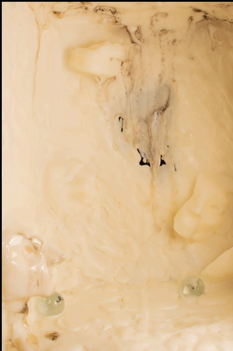
At the Bottom of the World, 2020, Inkjet Print.