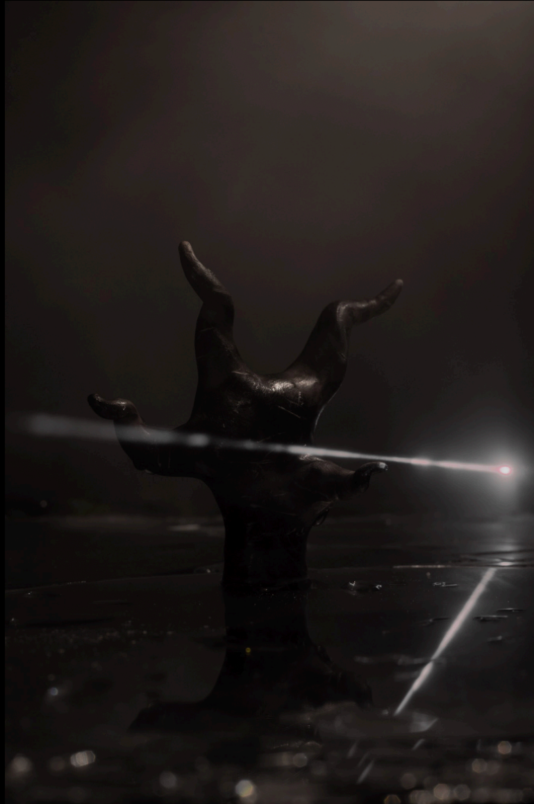
Middles , 2020, Inkjet Print.