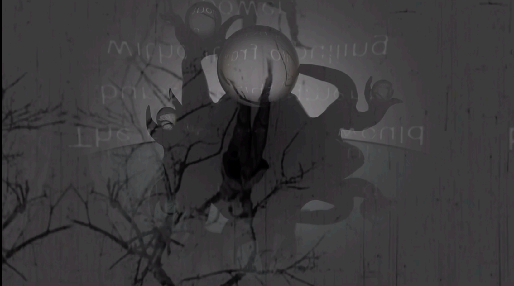
Still from Tabula Rasa , 2020, Video, 8:41. https://vimeo.com/486351780/482883dfa9