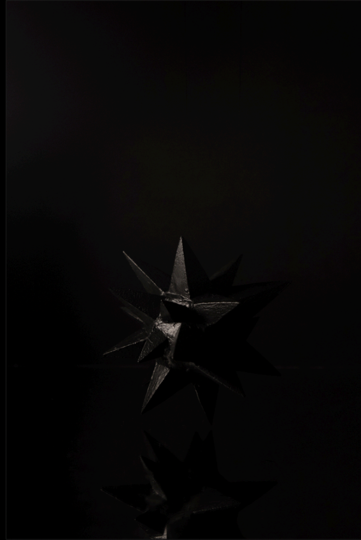
Over (Sol Niger) , 2020, Inkjet Print.