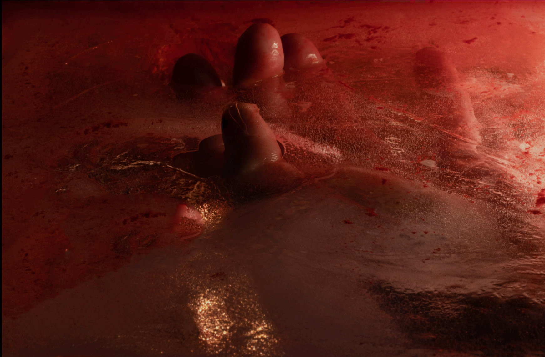
Under, 2020, Inkjet Print.