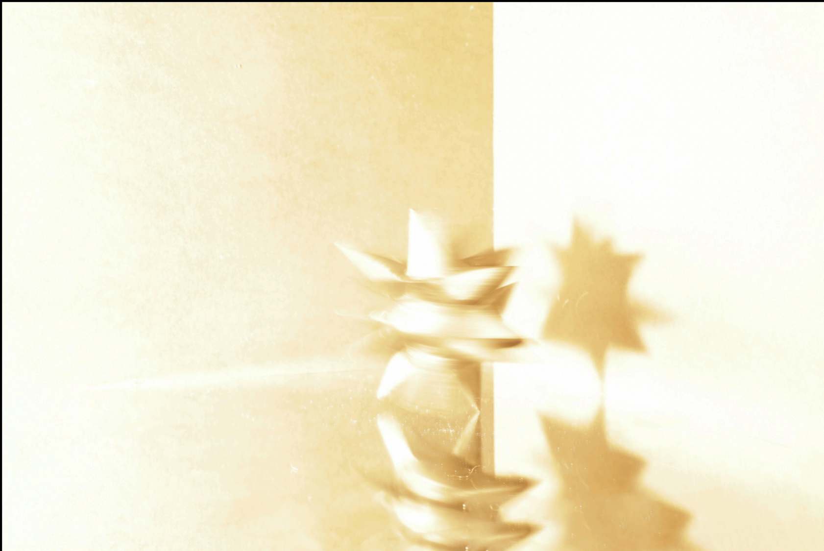
Over and Over and Over, 2020, Inkjet Print.